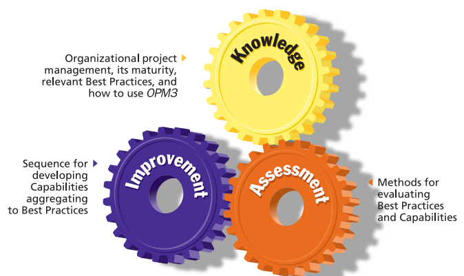
Elements of OPM3: Knowledge, Assessment and Improvement

OPM3 will help organizations utilize project management to accomplish their goals on time, within budget, and most importantly, to improve their overall effectiveness.